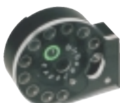
12 Shot .20, .22, .25 calibres