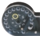
17 Shot .177 calibre only

Don't forget; Theoben can service or repair Rapid (& SLR) magazines to give you many years of trouble free use.